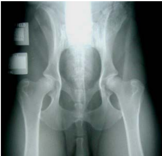
Hip with a good formation without articulation problems